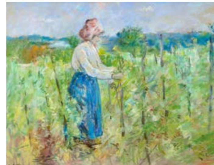
Berthe MORISOT Dans les vignes - 1882 Pastel on paper Stamped with the signature lower left; 46 x 58,50 cm - 18 1/8 x 23 in. Estimate : €250,000 - 350,000