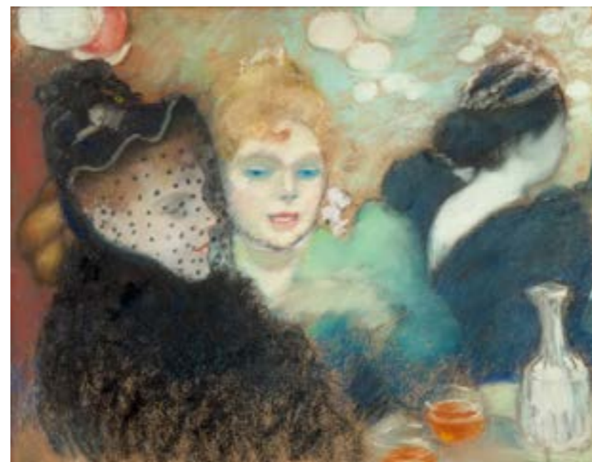
Louis ANQUETIN Au bar - circa 1891 Pastel on cardboard 53,50 × 70,50 cm - 21 × 27 3/4 in. Estimation : €250,000 - 350,000