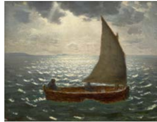
Jean-François MILLET Barque de pêche - circa 1870-1871 Oil on canvas Signed lower left «J.F. Millet» 32,50 x 40,50 cm - 12 3/4 x 16 in. Estimate : €500,000 - 800,000

Belgian Symbolism offers two rare jewels: the Étude pour la Défiance by Fernand Khnopff (est. €300,000 – 400,000), imbued with an aristocratic melancholy, and the striking Fillette au grand chapeau by Léon Spilliaert (est. €300,000 – 400,000), a work of unsettling presence. Redon, Puvis de Chavannes, Lévy-Dhurmer and Lacoste complete this foray into the world of interiority and dreams.