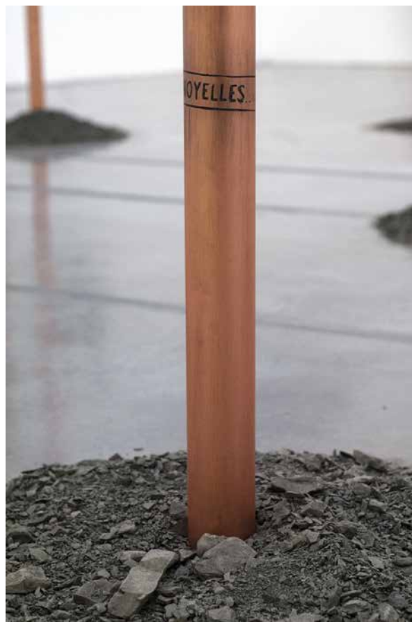
Forage mémoriel