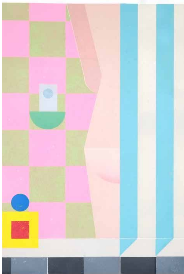
Aufstellung At Home (Bad), impression en relief, 640x470, 2023 © Badock

Sign-up required: https://lesmuseesdeliege.be/brochures