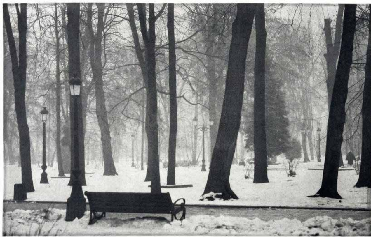
Kyiv, photopolymère, 285x300, Février 2022 - 2023