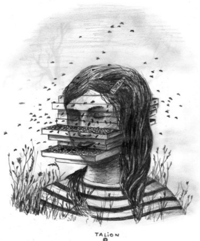
Talion, 3, algraphie, 360x 60, 2018-2021