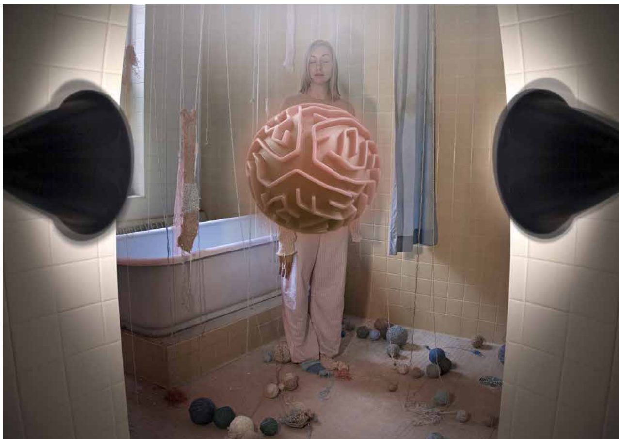
Feedback Loop, impression digitale, 610x864, 2022 © Davida Kidd

The itinerary and practical information can be found on the website: https://www.laboverie.com