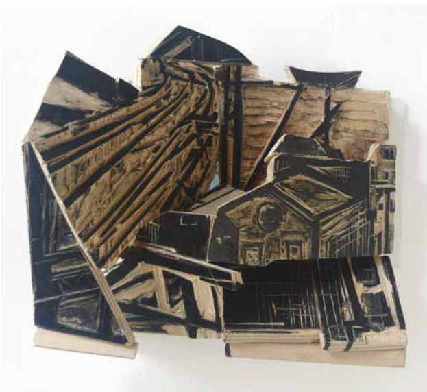
Onderdak , collage de plaques gravées sur bois, 200x220, 2023 © Hanna De Haan

Free – Sign up: www.laboverie.com/billetterie