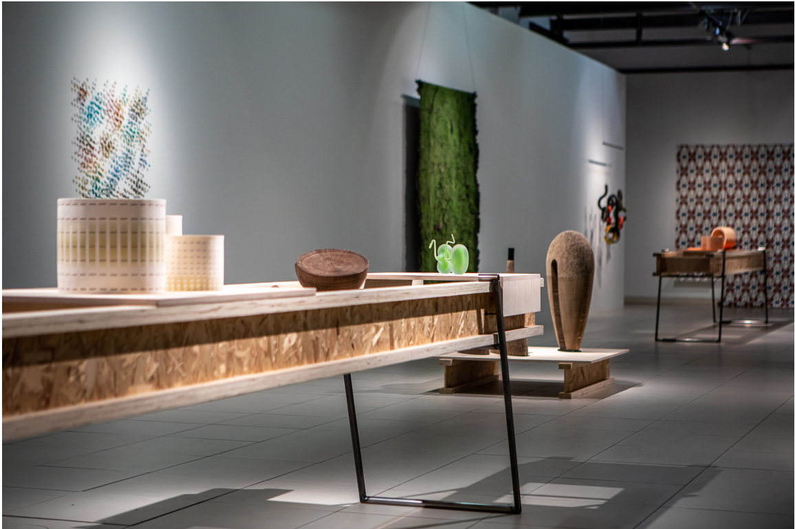
European Prize for Applied Arts 2021 Grande Halle of the Anciens Abattoirs of Mons