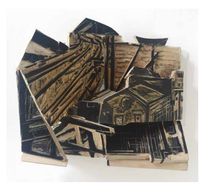
Onderdak, collage de plaques gravées sur bois, 200x220, 2023 © Hanna De Haan

Free – Sign-up required: www.lesmuseesdeliege.be