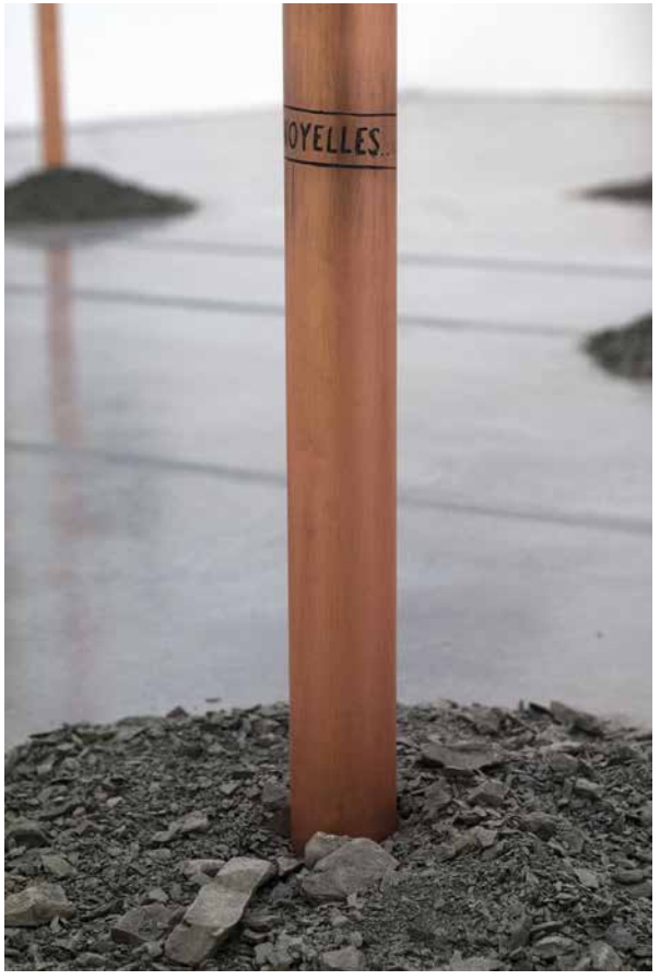
Forage mémoriel