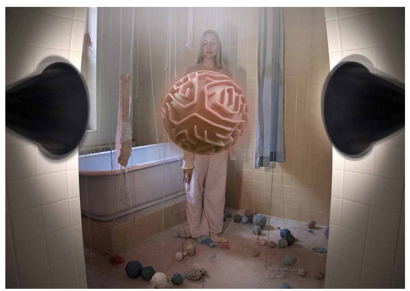
Feedback Loop, impression digitale, 610x864, 2022 © Davida Kidd

The itinerary and practical information can be found on the website: <u>https://www.laboverie.com</u>