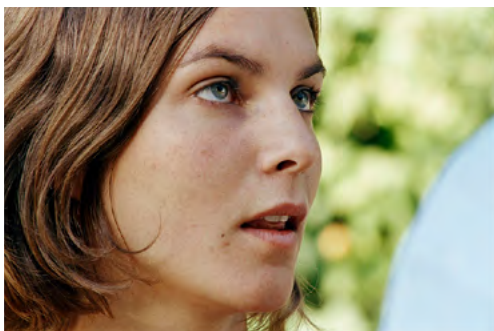
Chantal Maes Tropismes. Le fiancé [ Tropisms. The fiancé ], 2014 © Chantal Maes