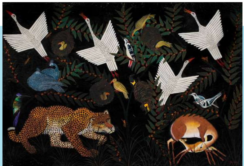
Pilipili MULONGOY Untitled (White herons) - 137 x 199 cm Estimate : 12 000 - 18 000 €