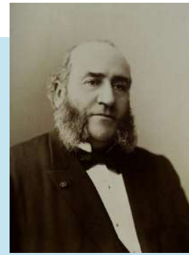
The doctor Jules Emile Péan