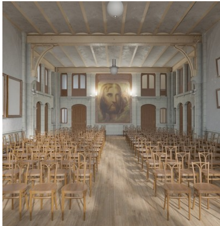
Laboratoire Alice, view of the Matteoti room (draft), 2019.

Architect and professor in the La Cambre-Horta Faculty of Architecture, ULB Researcher at the Laboratoire Alice, La Cambre-Horta Faculty of Architecture, ULB