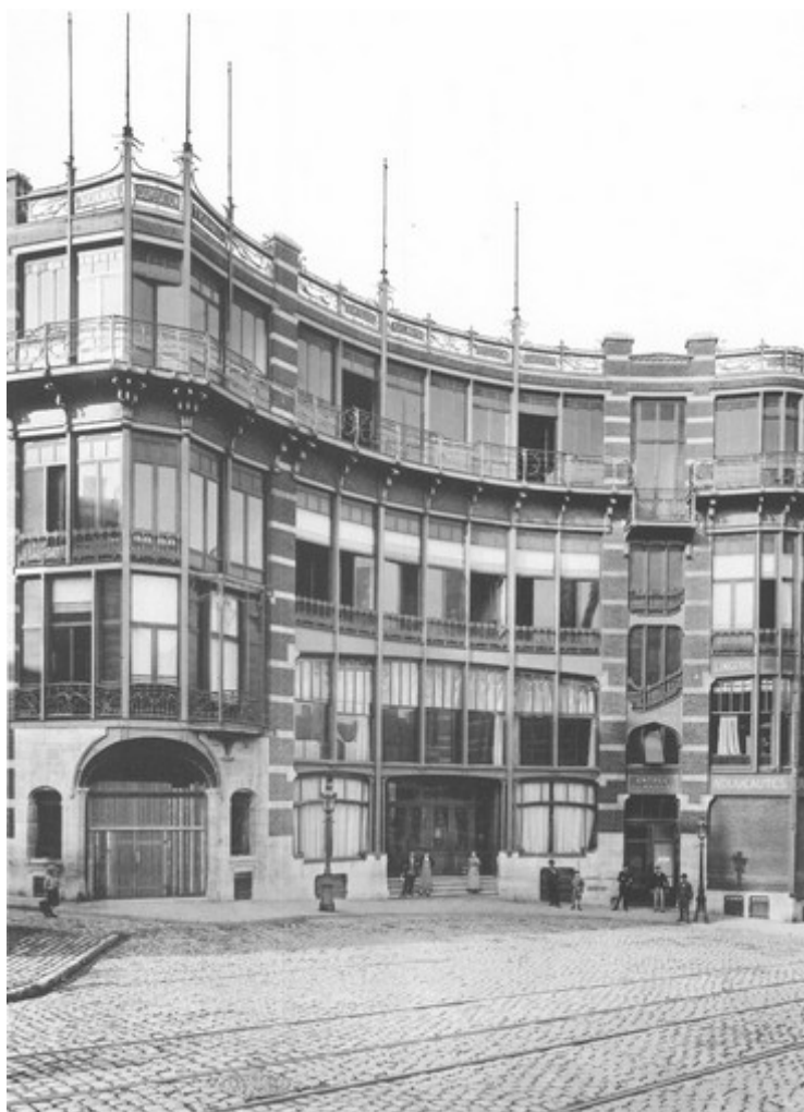
Ernst Wasmuth, plate from Neubauten in Brüssel, 1899. Horta Museum archives.

VIEWINGS AT THE HORTA MUSEUM FROM 19 DECEMBER 2019