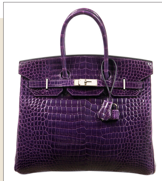
HERMÈS, crocodile Birkin bag 35 Estimate : €28 000 - 38 000