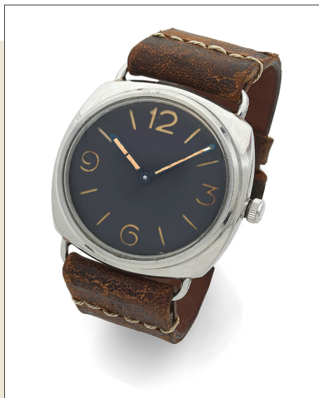
PANERAI, Radiomir Ref2646 Steel diving wristwatch Estimate : €85 000 - 100 000