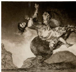
El caballo raptor 1815/19 etching/aquatint (Los Disparates)