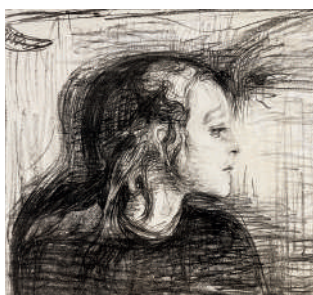
Sick Child 1896 lithograph Courtesy: MDR, Antwerpen