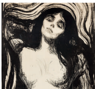
Madonna 1895/1902 lithograph