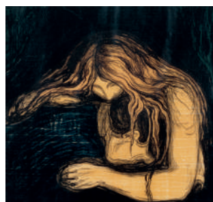
Vampire II 1895/1902 lithograph & wood engraving