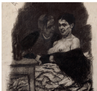
Le quatrième verre de cognac ca 1880 heliograph