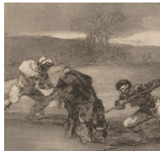
Otro modo de cazar a pie 1814/16 etching/aquatint (La Tauromaquia)