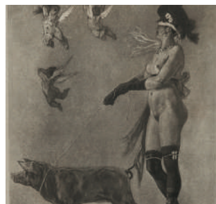
Pornocratès 1878 etching