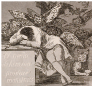
El sueño de la razón produce monstruos 1799 etching/aquatint (Los Caprichos)